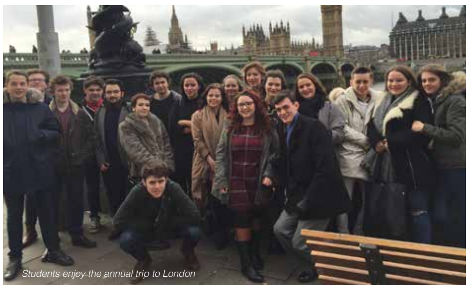
Students enjoy the annual trip to London