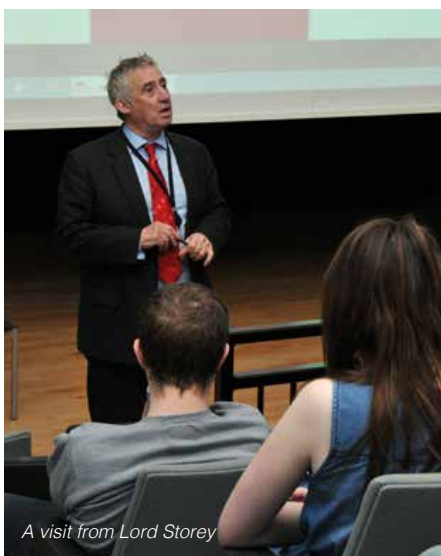
A visit from Lord Storey

This year the emphasis is still on acquiring political knowledge, but equal emphasis is now devoted to the development of more sophisticated critical evaluation skills. Our studies will have a more international flavour, with obvious emphasis on the USA (paper 2) and our "special relationship" with them.