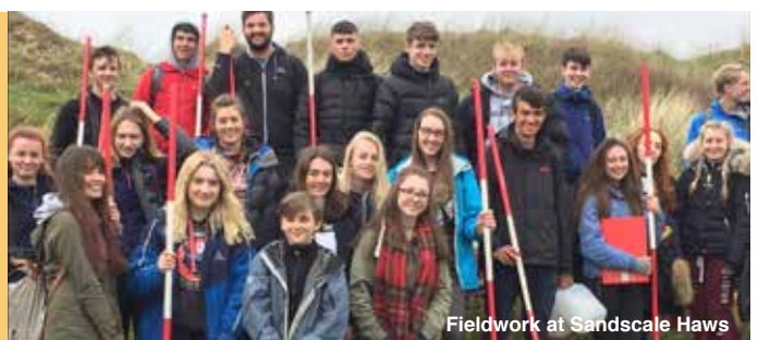
Fieldwork at Sandscale Haws