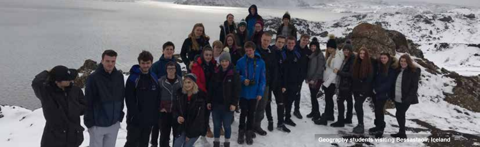
Geography students visiting Bessastaoir, Iceland