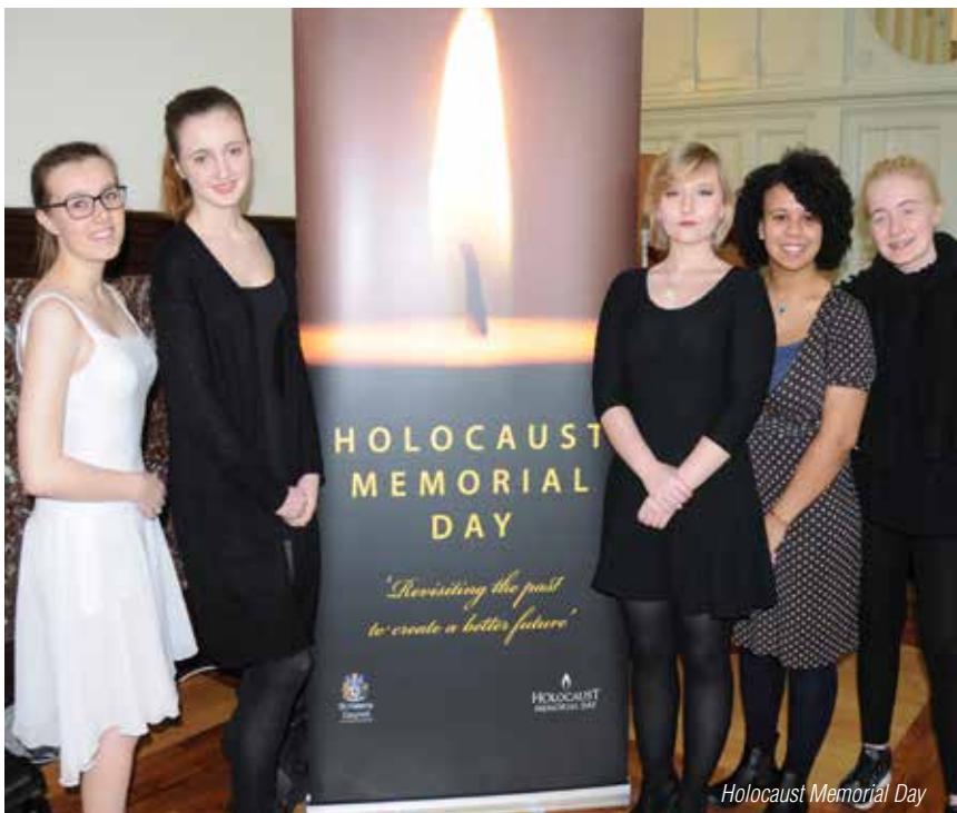
Holocaust Memorial Day