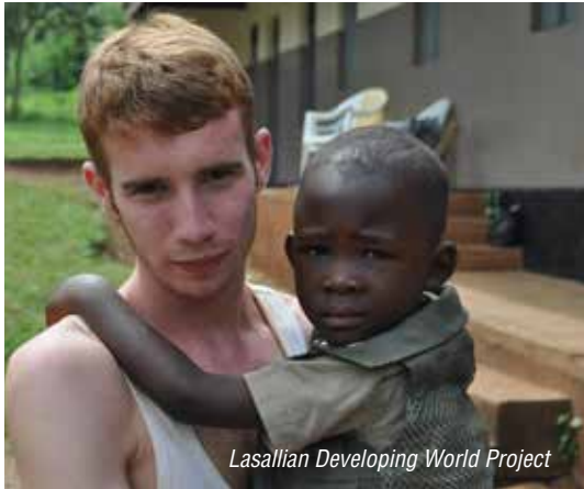
Lasallian Developing World Project

I've been educated further on topical and global issues that I was previously unaware of. I have also developed life skills that have supported work in my A Levels such as developing my use of empathy in Philosophy.