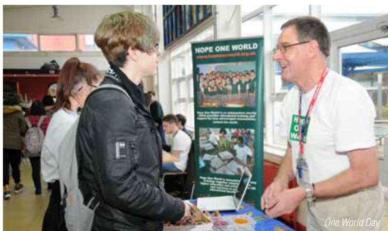
One World Day

The Ethics and Values department plays a central role in the education of all students at Carmel College. The department also runs and provides students with opportunities to get involved in cross-college events including charity events and theme days, such as One World Day. We also have specifically designed rooms which can open up to accommodate guest speakers from different organisations to enhance the learning experience and understanding of our students. We have close links with local charities such as Hope One World, Hope House (St Helens) and the Lasallian Developing World Project.