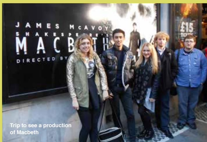
Trip to see a production of Macbeth

The English Department offers the opportunity to be involved in theatre visits, trips to places of literary interest, study days on specific examination modules, workshops on creative writing, examination preparation delivered by Senior Examiners and conferences on English Language. You can also, through Enrichment, be involved in debating, personal creative writing, and the poetry group.