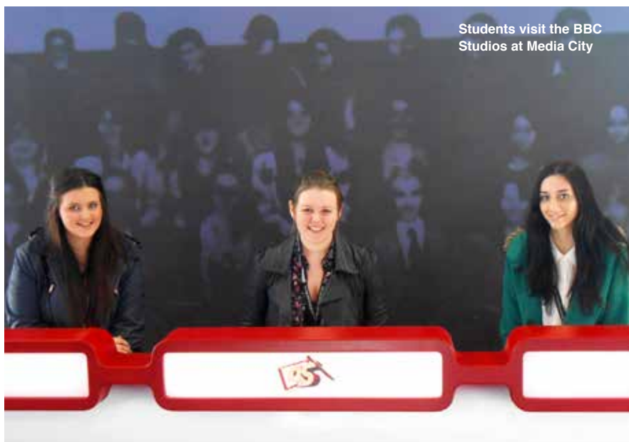
Students visit the BBC Studios at Media City