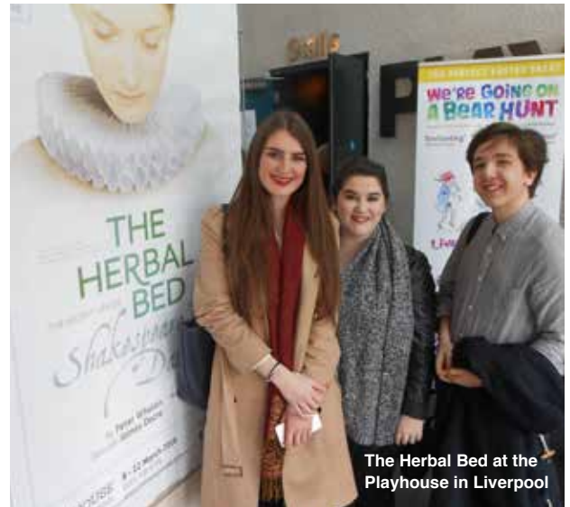
The Herbal Bed at the Playhouse in Liverpool