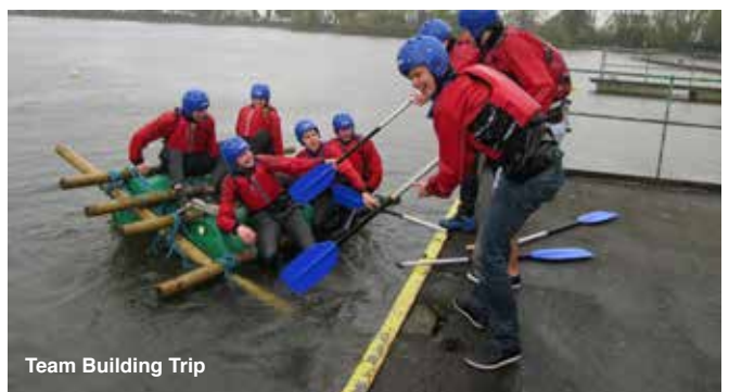
Team Building Trip