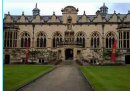
2016's Gifted and Talented students visit the Oxbridge colleges