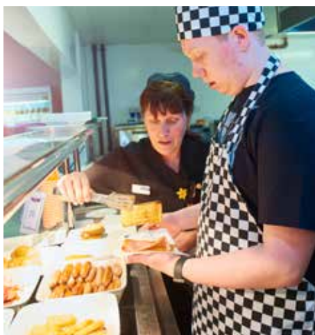
Work experience in the College restaurant