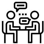
Role Play / Scenarios